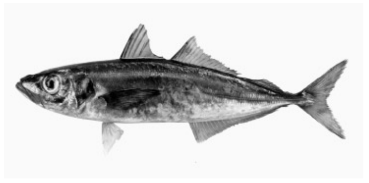
Jack Mackerel, Trachurus symmetricus

Large jack mackerel have occasionally contributed to the commercial passenger fishing vessel (CPFV or partyboat) sport fishery. In 1953, a run of large fish was encountered in southern California, which contributed 13 percent of the CPFV catch in southern California and 8.6 percent